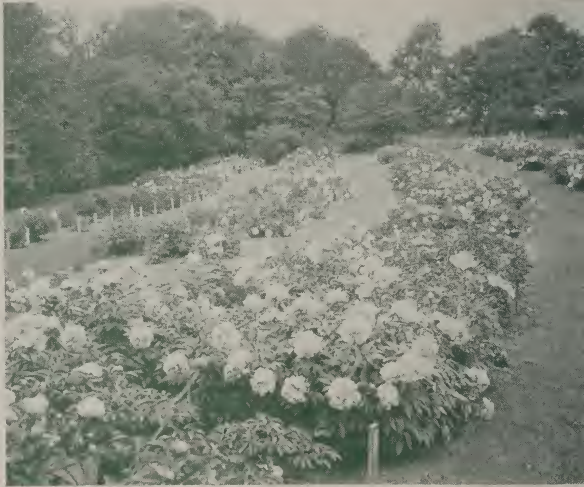
For sheer display peonies are supreme